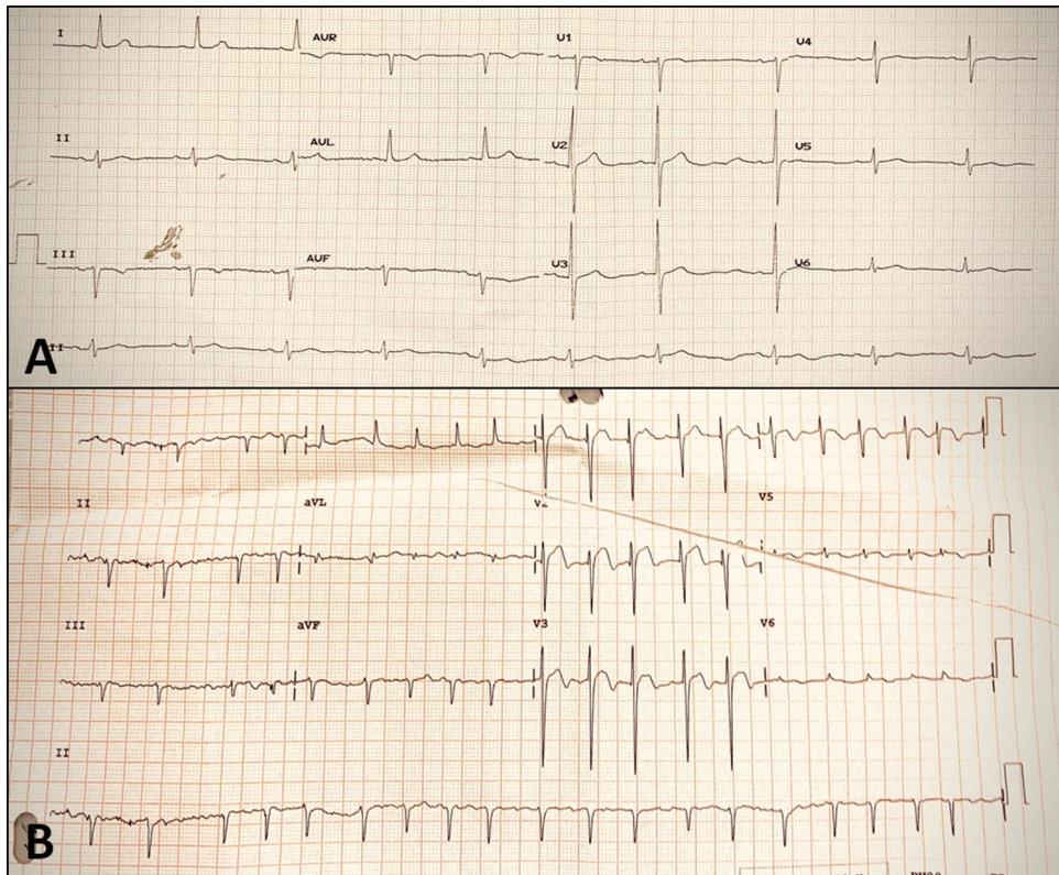
Figure 1 Baseline and follow-up electrocardiograms. (A) Baseline electrocardiogram with sinus rhythm and no ischemic or necrotic changes; (B) electrocardiogram during chest pain on the fifth day of hospitalization, showing atrial fibrillation and ST-segment elevation in leads V1-V4.