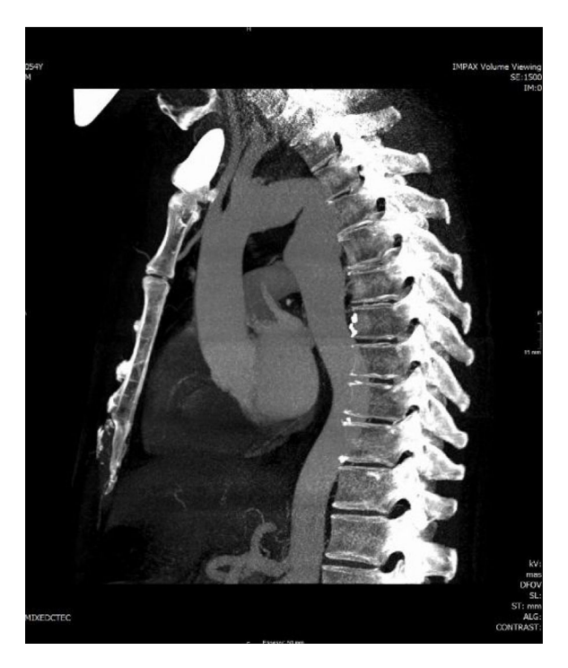
Figure 2 Postoperative computed tomography angiography showing the graft implanted in the thoracic aorta.

the origin of the two subclavian arteries and the descending thoracic aorta distal to the origin of the ARSA. Finally, the proximal segment of the ARSA was ligated with a continuous polypropylene suture in two planes.