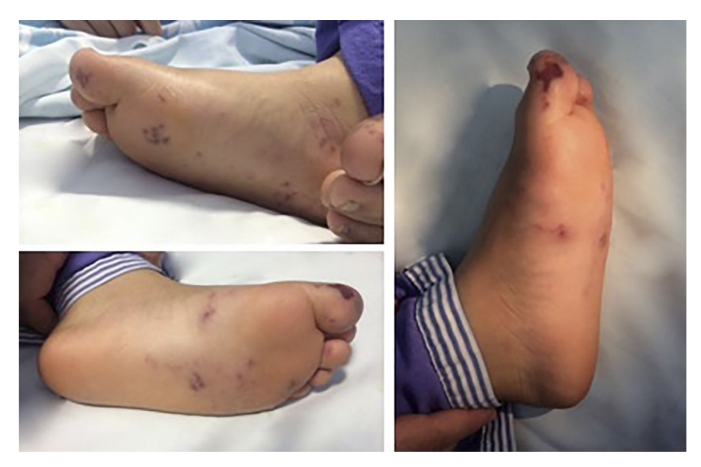
Figure 1 Purpuric rash and edema of both feet.