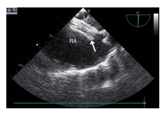
Figure 3 Transesophageal echocardiographic image of septal occluder device (arrow) after implantation. LA: left atrium; RA: right atrium.

cases are isolated and sporadic, but some are associated with genetic syndromes such as MRKH syndrome. ^{4}