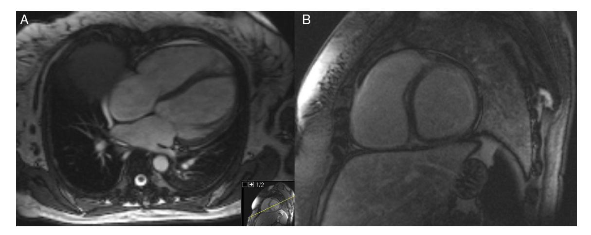
Figure 3 Cardiac magnetic resonance.

cardiac MRI (indicative of fibrosis) was detected in 60% of these patients. In the present case, a large area of subendocardial delayed enhancement was detected. Steen et al.,<sup>8</sup> in a series of 953 patients, reported cardiac symptoms in 15%. Mortality due to cardiovascular causes was 20%, most of which were recorded in the first five years of follow-up. In a cohort of 1012 patients,<sup>9</sup> 35% reported cardiac symptoms, 70% of deaths were related to cardiopulmonary disease while isolated heart involvement accounted for 36% of deaths. In a large international meta-analysis<sup>10</sup> renal, cardiac, and pulmonary involvement were described as important prognostic factors, and heart disease was present in 10% of patients (8–28% depending on the series).