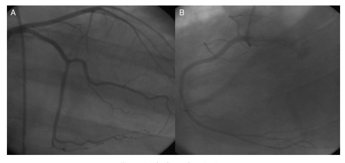
Figure 4 Cardiac catheterization.

The prevalence of angiographically documented coronary artery disease was reported to be similar to that in the general population (approximately 22%). Acute myocardial infarction is rare, with a rate of 1.09%.<sup>11</sup> Nevertheless, subclinical atherosclerosis has recently been detected by multidetector computed tomography in most of these patients.<sup>12</sup> Moreover, coronary reserve flow studies in SS have revealed a surprisingly reduced vasodilation capacity, a phenomenon that could be explained by abnormalities in small arteries.<sup>13</sup> In the case of our patient, the coronary arteries were found to be normal, as expected in a healthy young person.