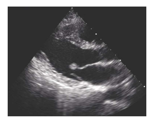
Figure 1 Transthoracic echocardiography revealing a 10.6 mm \times 8.3 mm mobile mass attached to the anterior mitral leaflet.

A 41-year-old man presented to the cardiovascular department with paroxysmal twinges in the left chest for three days. The initial chest radiograph, 12-lead electrocardiogram and laboratory findings were unremarkable. Transthoracic echocardiography revealed a 10.6 mm \times 8.3 mm mobile mass attached to the anterior mitral leaflet