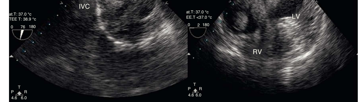
Figure 1 Transesophageal echocardiography. Bicaval (left) and 4-chamber view (right) showing an elongated mass extending from the inferior vena cava through the right atrium and crossing the tricuspid valve into the right ventricle. IVC: inferior vena cava; LA: left atrium; LV: left ventricle; RA: right atrium; RV: right ventricle.

cardiogenic shock, pulmonary embolism or even sudden cardiac death, have also been reported.<sup>3,4,9</sup>