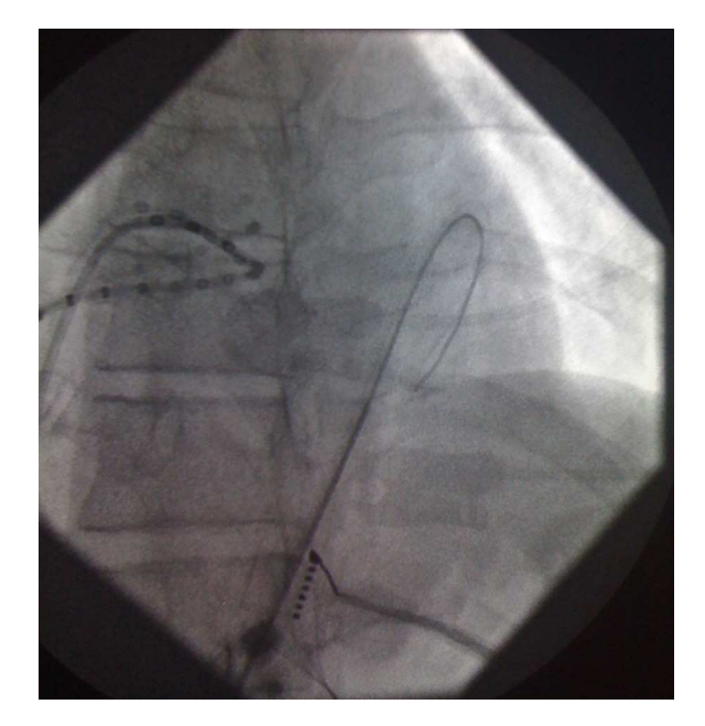
Figure 2 Insertion of guidewire in the pericardial space following subxiphoid puncture.

Pericardial access was obtained through percutaneous subxiphoid puncture with a Tuohy needle (or pericardiocentesis needle) as described by Sosa et al.<sup>9,10</sup> The puncture was made between the left margin of the xiphoid appendix and the lower margin of the adjacent rib with the needle directed towards the left shoulder (Figure 1). Correct positioning was confirmed by visualization of a small quantity of contrast ( \sim 1 ml) in the epicardial space, after which a guidewire was inserted (Figure 2). An introducer was passed over the guidewire, followed by the ablation catheter.<sup>10</sup> After access to the epicardial space was obtained, intravenous heparin (100 U/kg) was administered to enable coronary angiography and endocardial ablation to be performed safely. Once within the epicardial space, the catheter can be manipulated to map the entire epicardial surface<sup>11</sup> (Figures 3 and 4). A 4-mm catheter was used in the first two cases, while an irrigated catheter was used in the other six. In all cases the ablation strategy was to identify the critical isthmus involved in sustaining the tachycardia with the aid of electroanatomical mapping (CARTO system, Biosense Webster). The radiofrequency parameters employed depended on the type of catheter - 20-50 W for the 4-mm catheter and 15-30 W for the irrigated catheter (8-15 cc/min). During the procedure, the epicardial space was drained using a pigtail catheter for set periods of