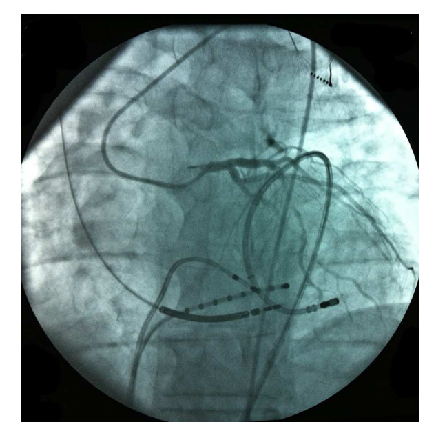
Figure 3 Manipulation of mapping/ablation catheter in the pericardial space guided by coronary angiography.

The mapping and ablation techniques were similar to those used in the endocardial space, although entrainment maneuvers are more difficult using bipolar pacing due to the high epicardial stimulation threshold. On electroanatomical mapping, areas with bipolar voltage of less than 0.1 mV were considered to be scar tissue. All patients