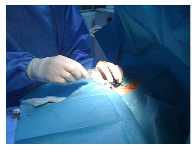
Figure 1 Subxiphoid puncture towards the left shoulder.