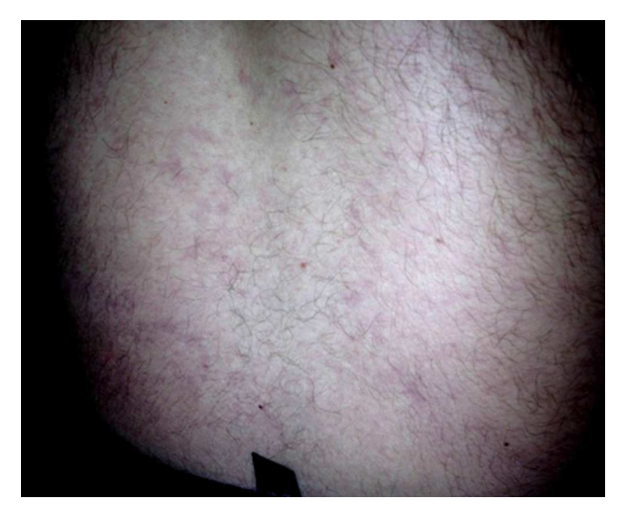
Figure 2 Photograph of the patient's back on May 24, 2010 showing purplish livedo reticularis.

At the first cardiological consultation, four months after discharge (May 24), the patient reported no symptoms apart from a single episode of typical angina three weeks previously, triggered by exertion and lasting for five minutes, which resolved spontaneously after 30 minutes' rest; he did not seek medical help. He reported arthralgia in the proximal interphalangeal joints of both hands and a history of photosensitivity (although not recent). Physical examination revealed LR, purplish in color, with irregular borders, on the lower half of the trunk (Figure 2), which according to the patient he had had ''for a long time'' and was now less marked than in the acute phase of the stroke. No other alterations were observed, including neurological