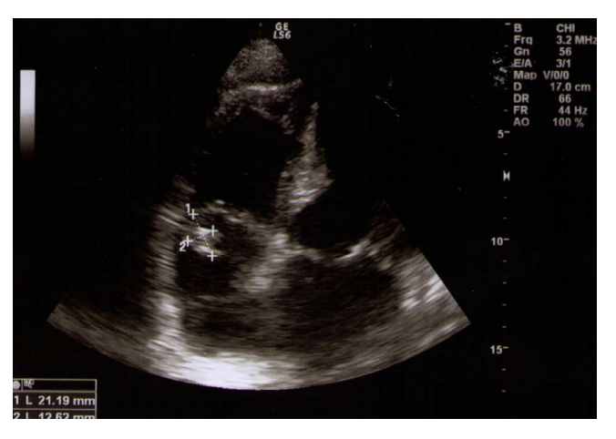
Figure 3 Tricuspid valve with mobile echogenic structure compatible with vegetation measuring over 13 mm.

In the present case, the patient's predisposition due to valvular disease and gastrointestinal endoscopic examination may have been responsible for his disease. Symptoms developed insidiously, with progressive worsening of heart failure and petechiae, and diagnosis was only achieved due to the acute symptoms of a subphrenic abscess caused by the splenic infarct secondary to endocarditis. The pulmonary consolidation discovered on CT scans occurred by transdiaphragmatic dissemination. G. morbillorum bacteremia and the favorable outcome after the institution of appropriate therapy confirm that this was the pathogen involved, despite the lack of blood culture identification in other specimens.