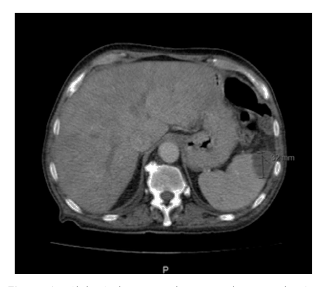
Figure 4 Abdominal computed tomography scan showing splenic infarction.

Notwithstanding the institution of prompt and appropriate tailored antibiotic therapy, the patient had an initially unfavorable outcome, and urgent surgery was needed due to acute heart failure caused by the destruction of the anterior leaflet of the mitral valve and regurgitation of the other valves. Surgery also substantially reduced the risk of new septic emboli arising from the presence of >10-mm vegetations.<sup>8</sup>