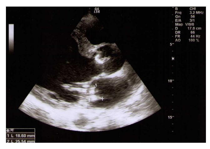
Figure 1 The atrial face of the mitral valve anterior leaflet shows a mobile echogenic structure compatible with vegetation about 15 mm in size. The anterior leaflet is thickened, with tissue destruction and likely perforation, causing severe mitral regurgitation.