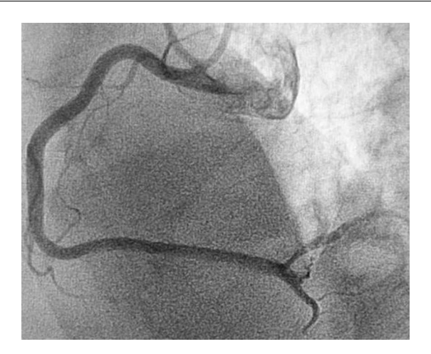
Figure 3 Right coronary artery after thrombus aspiration and balloon angioplasty.

Balloon angioplasty was successful, with no residual lesion and with final TIMI flow 3 (Figure 3).