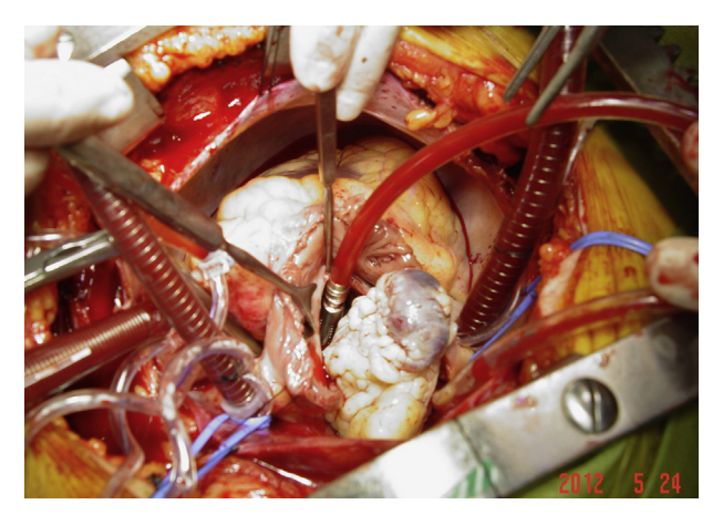
Figure 3 Photograph taken during surgery.

The operation took longer and was more complex than expected and the postoperative period was complicated by a stroke on the second day manifested clinically by left