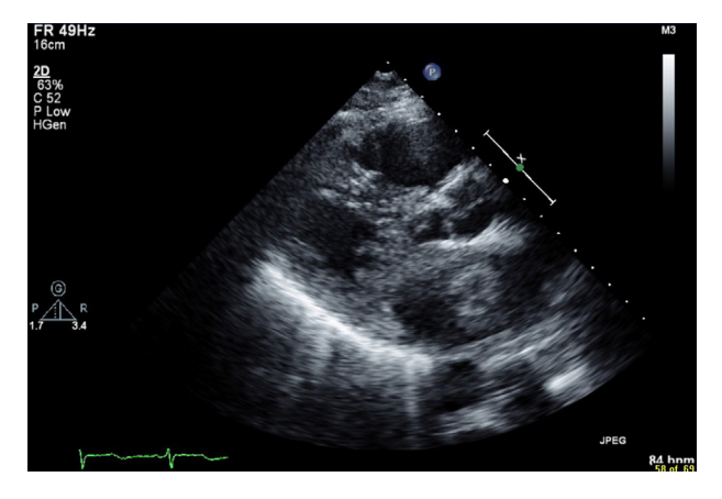
Figure 1 Two-dimensional echocardiogram in parasternal long-axis view showing a well-defined structure in the left atrium attached to the interatrial septum.

As part of surgical evaluation, cardiac catheterization was performed, which revealed only non-significant vessel wall disease in the mid anterior descending coronary artery. Given the size of the lesion and the resulting obstruction, the patient was rapidly proposed and accepted for surgery.