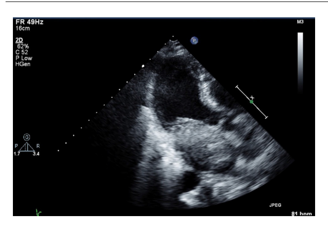
Figure 2 Two-dimensional echocardiogram in apical 3-chamber view, showing the same structure (approximately 5.4 cm \times 3.2 cm), protruding into the left ventricle in diastole.

In view of the location of the mass and the clinical setting, the initial diagnostic hypothesis was a cardiac myxoma.