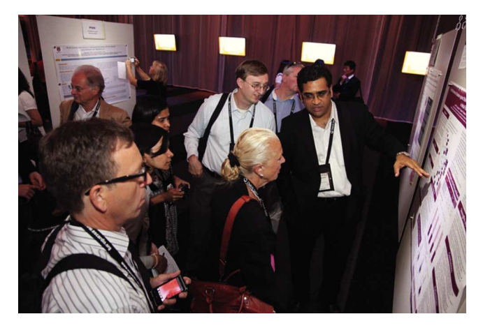
Figure 1 (ESC 2351) Discussions around a poster at ESC Congress.

findings from each of the presented studies (Figures 1–3). Also for the first time, poster presentations will be stimulated by discussants who are experts in that field of investigation. Another innovation is "Meet the Legends in Cardiology", where participants will be able to post questions in advance or during the session to individuals who have changed our understanding and helped determine the shape of cardiology in 2013.