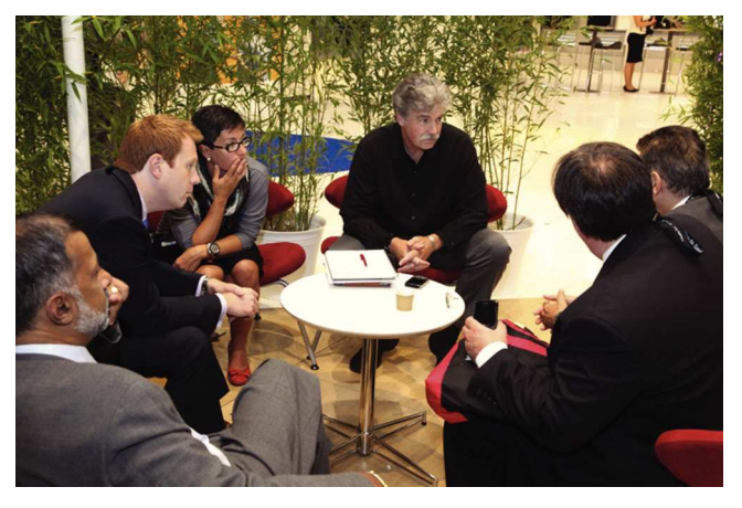
Figure 2 (ESC 3704) Round table discussions at ESC.