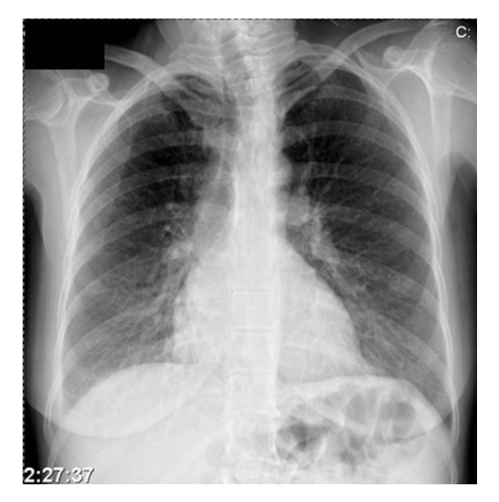
Figure 2 Chest X-ray.

Symptomatic treatment for HF was started with diuretics, angiotensin-converting enzyme (ACE) inhibitors and nitrates, but there was little symptomatic relief and the hypocalcemia was investigated further. Hypocalciuria and hyperphosphatemia were also detected due to reduced parathyroid hormone levels (Table 3). Investigation of the etiology of hypoparathyroidism ruled out cancer, infiltration, and polyglandular and autoimmune syndromes, and a diagnosis of idiopathic hypoparathyroidism was made. Renal ultrasound showed no alterations and a cranial CT scan