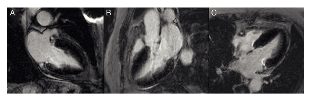
Figure 3 Inversion recovery delayed enhancement images in 2-, 3- and 4-chamber views (A, B and C, respectively) demonstrating the absence of areas of hyperenhancement.

This case illustrates the feasibility of cardiac MRI in this setting and the usefulness of the recently introduced MRI-conditional pacemaker systems. To the best of our knowledge, this was also the first cardiac MRI performed in Portugal on a patient with an MRI-conditional pacemaker. We welcome it as the first of many to come.