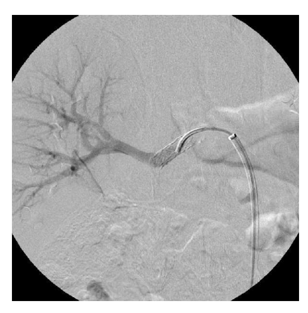
Figure 3 Selective right renal angiography after stent implantation in the superior right renal artery showing exclusion of the aneurysms.