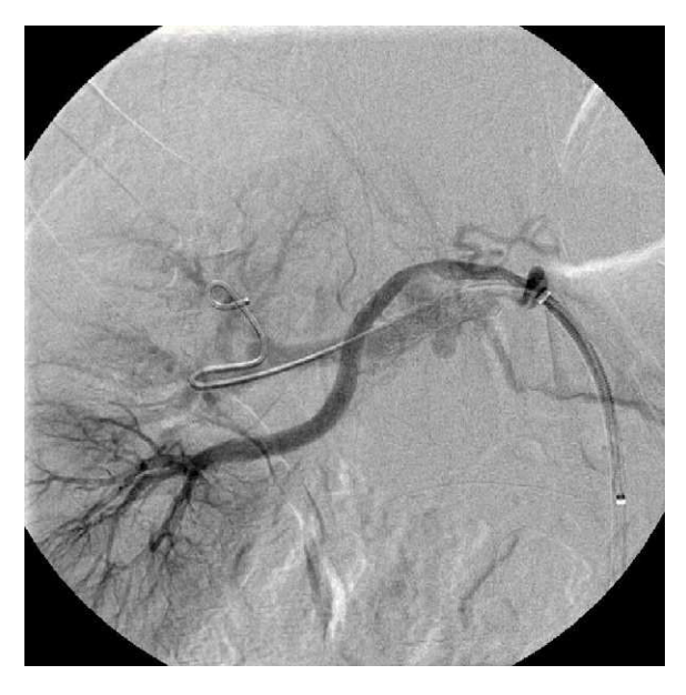
Figure 2 Right renal angiography after implantation of a 6 \times 22 -mm stent in the superior right renal artery.

The development and wide dissemination of non-invasive imaging techniques has led to the diagnosis of an increasing number of new cases of secondary hypertension. Cases formerly designated as essential hypertension now have a