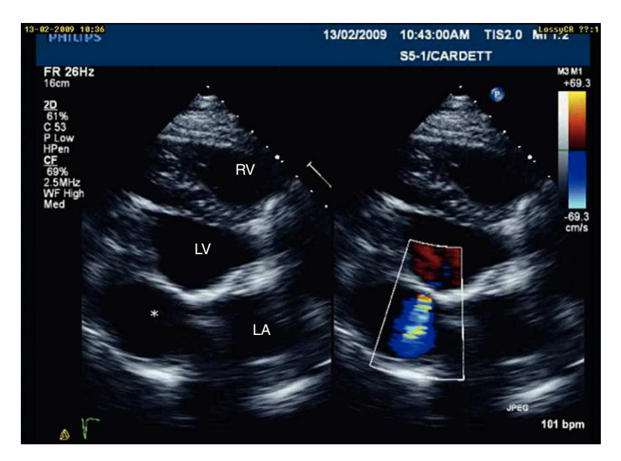
Figure 3 Parasternal long-axis view, showing a reduction in the size of the aneurysm (*) but a small leak through the pericardial patch on color Doppler. LA: left atrium; LV: left ventricle; RV: right ventricle.

LV mycotic aneurysms can rupture into the pericardium and cause tamponade,<sup>4,5</sup> or they can heal without requiring intervention.<sup>6</sup> In our patient, the size of the aneurysm, the thinness of its wall and presumed rapid evolution were taken as signs of imminent rupture, which prompted the decision for surgical treatment. Replacement of the mitral valve was the price paid to exclude the aneurysm. Nevertheless, resolution of the LV infection, with minimal residual scarring and impairment of LV function, leads us to believe that surgical treatment was the best option in this case.