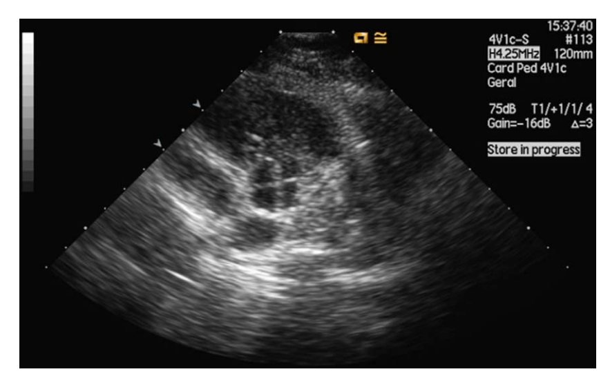
Figure 1 Type A quadricuspid aortic valve.

At age 6 months, routine TTE showed a restrictive perimembranous VSD, partially closed by tricuspid tissue, and type A quadricuspid aortic valve was diagnosed, with normal valve function.