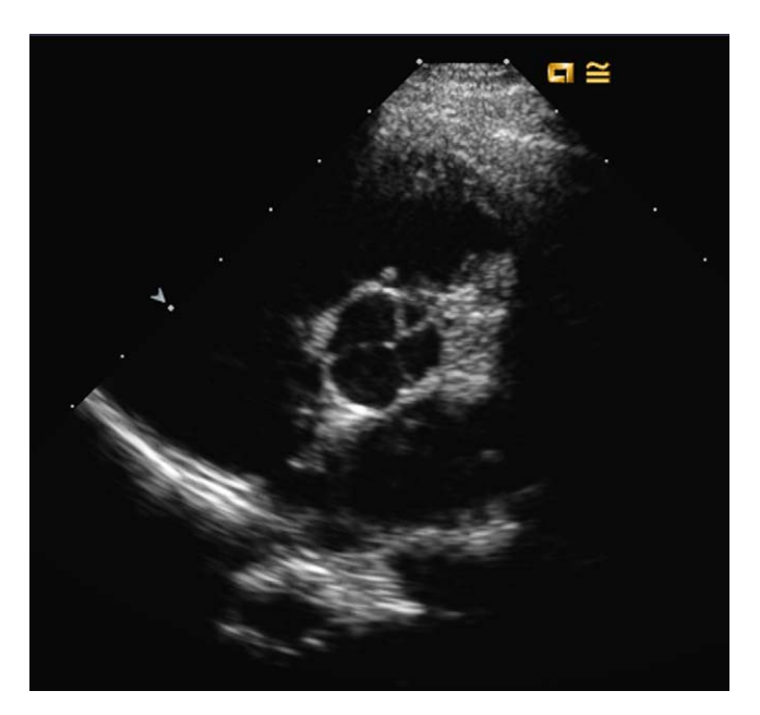
Type F quadricuspid aortic valve.

Systematic autopsy studies have estimated its incidence between 0.003<sup>1</sup> and 0.008%, <sup>11</sup> while a more recent echocardiographic review reported an incidence of 0.043%.<sup>2</sup>