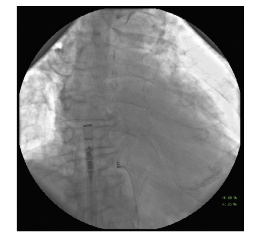
Figure 1 Advancing the catheter system into the right atrium.

Leadless pacemakers represent a paradigm change in pacing. This patient is among the first group of patients implanted with a Micra system in Portugal (Figures 1-3).