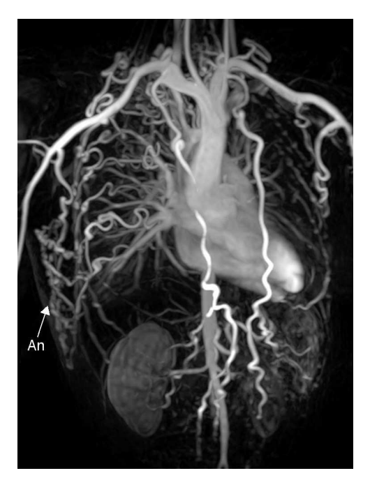
Figure 2 Three-dimensional volume rendering magnetic resonance angiography images, anterior coronal view, showing dilated intercostal, intramammary and thoracodorsal arteries with accompanying anastomosis between thoracodorsal artery branches and intercostal arteries. An: anastomosis.