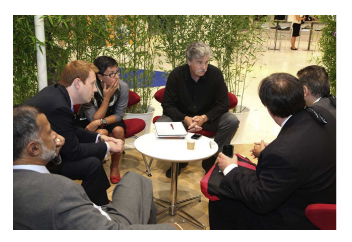
Figure 2 (ESC 3704) Round table discussions at ESC.