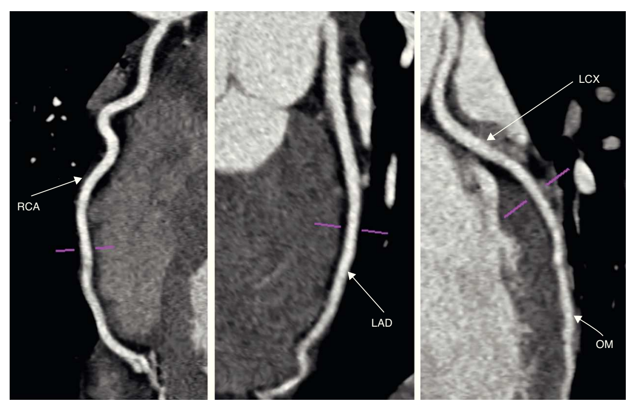
Figure 1 Cardiac computed tomography: multiplanar reconstructions ruling out significant coronary artery disease. LAD: left anterior descending artery; LCX: left circumflex artery; OM: obtuse marginal artery; RCA: right coronary artery.

Although the patient had no angina, obstructive coronary artery disease was ruled out prior to aortic surgery. This evaluation should be performed in asymptomatic male patients over the age of 40 or postmenopausal women, and is also indicated for patients with previous coronary artery disease, symptoms of left ventricular dysfunction, presumed ischemic mitral regurgitation or one or more cardiovascular risk factor.<sup>4</sup>