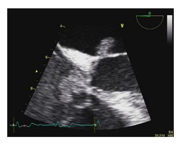
Figure 4 Transesophageal echocardiography: detail of anterior mitral valve leaflet vegetation, and extension to the mitral-aortic junction and septal tricuspid leaflet.

Although the patient had neurologic involvement, urgent surgery was considered given the presence of heart failure, locally uncontrolled infection and multiple embolic events (all major surgical indications), in the absence of cerebral hemorrhage. On day nine, the patient underwent mitral and tricuspid valve replacement surgery, with implantation of bioprosthetic valves. Post-operative TEE showed preserved biventricular systolic function, normally functioning bioprosthetic valves and no intracardiac shunts. Serial follow-up TEE showed no images of vegetations or abscesses.