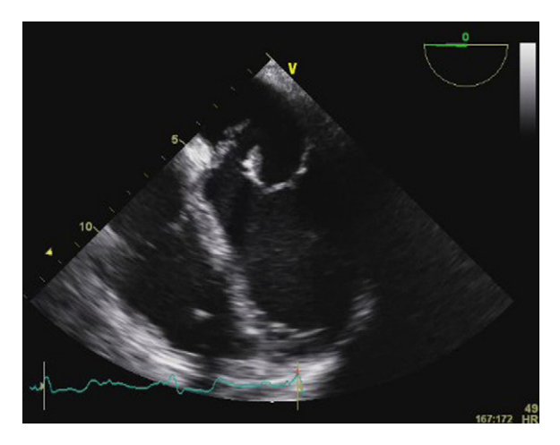
Figure 2 Transesophageal echocardiography showing anterior mitral valve leaflet rupture.

Since the major affected valve was on the left side and the echocardiographic findings were so pronounced within a few days after pacemaker insertion, the endocarditis was considered to have resulted from the bacteremia detected in the previous hospitalization, with primary involvement of the mitral valve and extension of the infectious process to the mitral-aortic junction and tricuspid valve, with damage