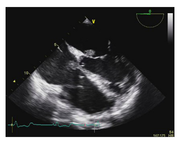
Figure 3 Transesophageal echocardiography showing large vegetations on the anterior mitral valve leaflet and septal tricuspid leaflet.

to the conduction system, causing the bradyarrhythmia that led to the present admission.