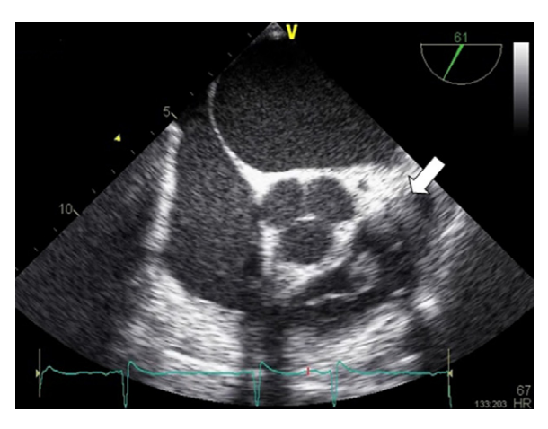
Figure 3 Transesophageal 61° view of aortic valve. Pulmonary valve vegetation is indicated by the white arrow.

echocardiography during hospitalization showed only mild to moderate pulmonary regurgitation. The patient had no other clinical manifestations or identifiable complications, including thromboembolism. Blood cultures were negative after the antibiotic course was completed. The patient was discharged home after six weeks. Nevertheless, the pre-discharge echocardiogram revealed persistence of the vegetations (Figure 4), which had developed a fibrotic appearance, and persistent mild to moderate pulmonary regurgitation.