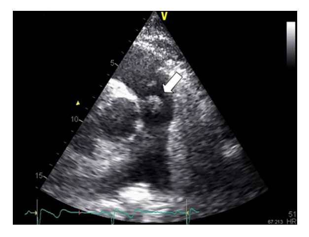
Figure 4 Short-axis view of vegetation on pulmonary valve after 6 weeks of antibiotic therapy, indicated by the white arrow.

In association with TV endocarditis, pulmonary valve IE is a rare entity, but it is even less common when it arises in isolation. It is assumed that its rarity is due to the low pressure gradients within the right heart, the low prevalence of congenital malformations, the lower oxygen content of venous blood and the differences in the covering and vascularization of the right heart endothelium.<sup>3</sup> Pulmonary valve IE is more frequent in males carrying the risk factors of intravenous drug abuse, alcoholism, sepsis or infection of central venous catheter or pacemaker leads.<sup>3</sup>