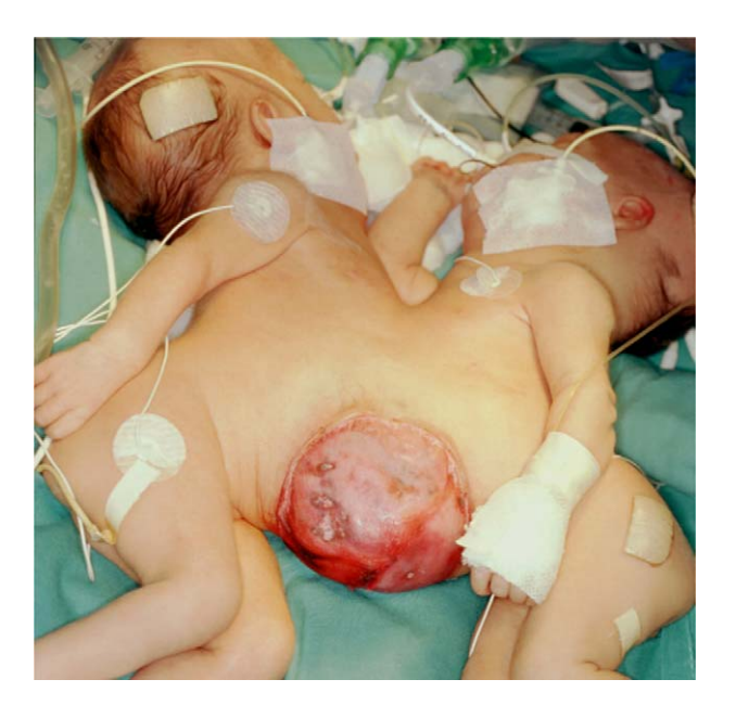
Figure 1 Omphalo-thoracopagus twins showing the shared thorax and abdomen.

Surgical attempts to separate the two twins was unsuccessful, both infants dying in the operating room. Autopsy examination confirmed the shared right atria, with relative heart hypoplasia in one twin (Figure 3).