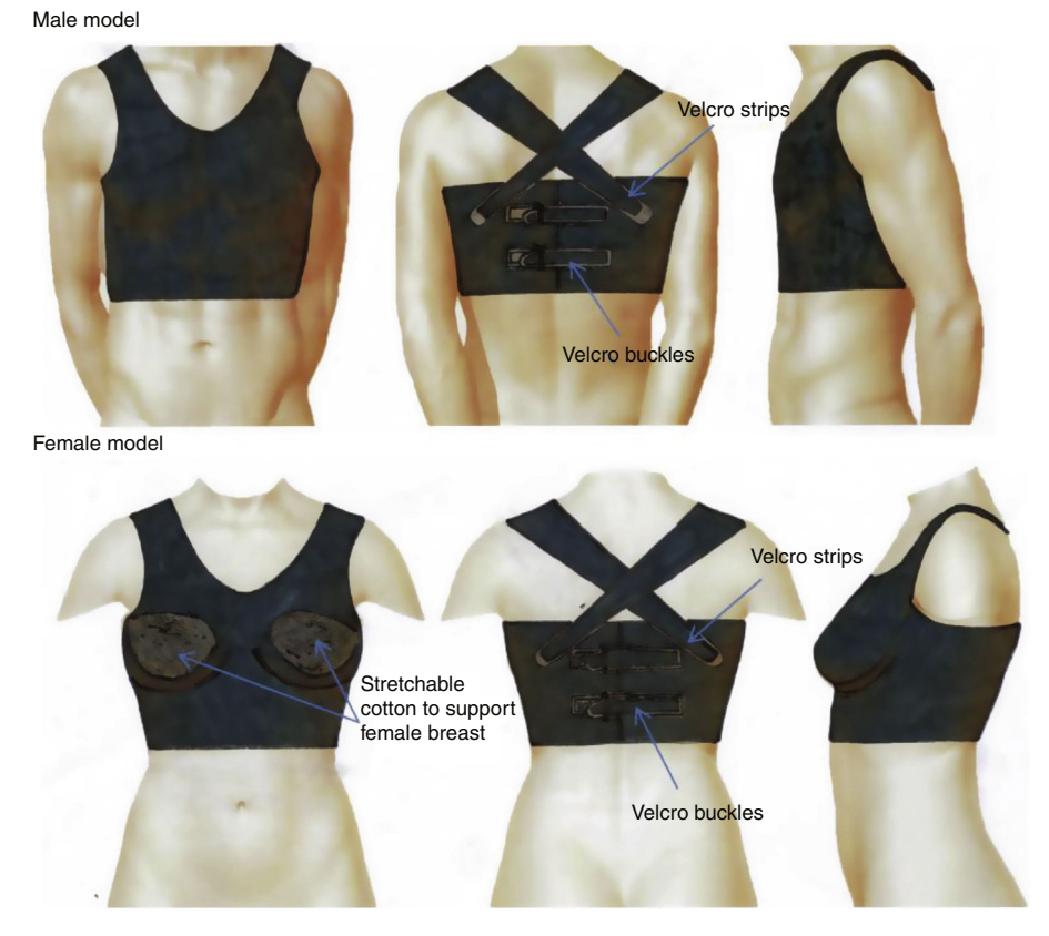
Figure 2 The thoracic vest in which the MONITORIA is embedded.

All the data given by the sensors are recorded transiently in the patient's mobile phone, before being sent to the cloud server. The patient's mobile phone will have an application, specifically developed for MONITORIA, which instructs the patients whenever appropriate. This will inform them of the most suitable time for meals (ensuring the correct measurement of skin sodium content) and giving them the feedback regarding their physical activity, informing them if they have