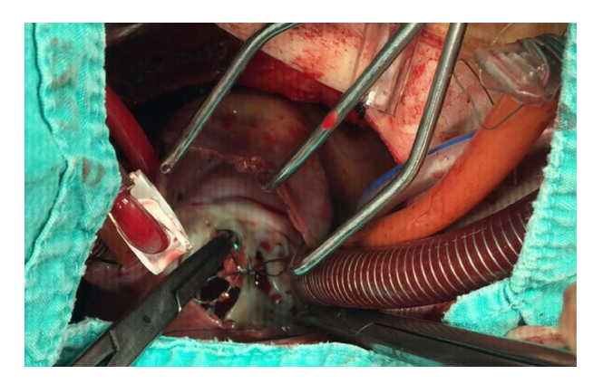
Figure 2 Intraoperative imaging showing that all margins of the occluder device were properly attached to the interatrial septum and there was no displacement.