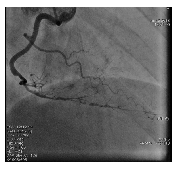
Figure 1 First angiogram of the right coronary artery (RCA), showing a long spontaneous coronary artery dissection from the distal RCA to the distal posterior descending artery and posterolateral branches.

On admission the pain was decreasing; the physical examination was unremarkable, the electrocardiogram showed sinus rhythm, with negative T waves in the inferior leads, and troponin I was positive. The pain eventually disappeared after intravenous nitrates, and she was admitted