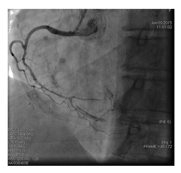
Figure 2 Second angiogram of the right coronary artery, showing a wider false lumen in the posterior descending artery, greater true lumen compromise and worse flow to the posterolateral branches.