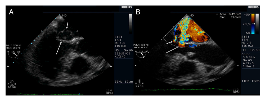
Figure 3 Transesophageal echocardiogram (3-chamber view). (A) Ruptured aneurysm of the anterior mitral valve leaflet. The long arrow points to the entry site and the small arrow points to the exit site of the aneurysm; (B) color Doppler image showing two mitral regurgitation jets: a small jet through the leaflet coaptation point (small arrow) and a much more significant one through the aneurysm (long arrow).

MVA must be differentiated from various abnormalities with similar echocardiographic appearance including severe mitral valve prolapse, diverticulum of the mitral valve, large valvular vegetation, flail valve leaflet, blood cyst of the papillary muscle, cystic atrial myxoma or non-endothelialized cyst of the mitral valve. <sup>24,30</sup> Color flow Doppler helps distinguish an aneurysm from other similar-