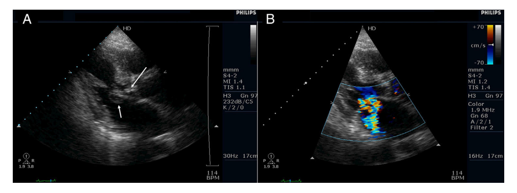
Figure 1 Transthoracic echocardiogram (parasternal long-axis view). (A) Saccular bulge on the atrial side of the anterior mitral valve leaflet (small arrow) and a vegetation on the aortic valve prolapsing into the left ventricular outflow tract, in close contact with the anterior mitral valve leaflet (long arrow); (B) significant mitral regurgitation (color flow Doppler).