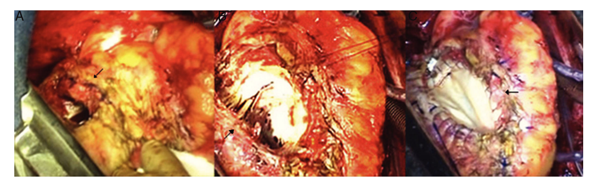
Figure 2 (A) Intraoperative photographs showing the entrance orifice (arrow) to the false aneurysm in the posterobasal aspect of the left ventricle; (B) intraoperative findings after dissection of the left ventricle, showing the cavity communicating with the previously repaired LVA, and contained by the diaphragm; (C) intraoperative view; arrow shows left ventricular restoration with an elliptical bovine pericardial patch.

Figure 1 (A) Magnetic resonance images showing the presence of three ventricular cavities; (B) left ventriculography showing large bilobulated aneurysm in the inferior wall of the left ventricle. LV: left ventricle; LVA: left ventricular aneurysm; LVPA: left ventricular pseudoaneurysm.