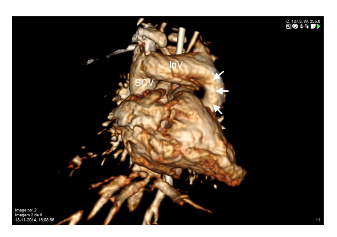
Figure 3 Three-dimensional computed tomography reconstruction in anterior view showing a vertical vein (solid arrows) with direct connection to the innominate vein (InV) and then to the superior vena cava (SCV).

Figure 2 Three-dimensional computed tomography reconstruction in posterior view showing four pulmonary veins (solid arrows) draining into a retroatrial conduit (dashed arrows) and then into the coronary sinus (CS).