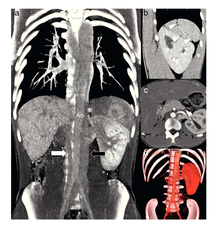
Figure 2 (a) Coronal plane volume rendering reconstruction showing duplicated IVC with left dominance, with the left IVC (black arrow) continuing cranially through the hemiazygos system without joining the right IVC and the right IVC (white arrow) continuing to the liver; (b) sagittal reformatted contrast-enhanced computed tomography showing an extensively septated spleen consistent with polysplenia (arrows); (c) axial reformatted contrast-enhanced computed tomography showing associated absence of the pancreatic tail and lateral part of the body (arrow); (d) coronal three-dimensional volume rendering showing absence of the right kidney. Ao: aorta.