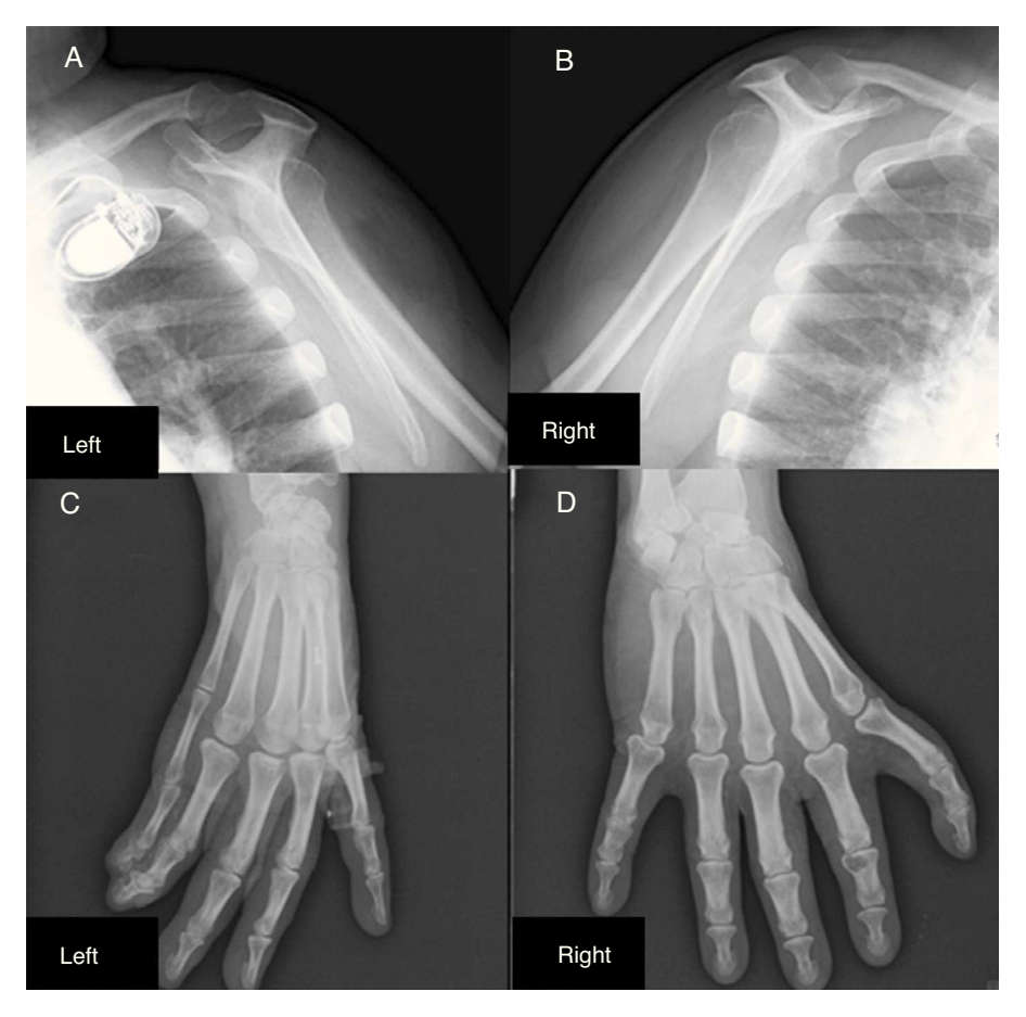
Figure 4 Shoulder girdle X-ray showing hypoplasia of the glenoid cavity and bilateral degenerative changes of the gleno-humeral joints (A and B); X-ray showing syndactyly between the first and second axes of the left hand and wrist; the trapezium and trapezoid cannot be differentiated (C); right hand with morphological changes of the proximal carpal row; the first finger of the right hand is morphologically similar to the others (D).

patients with radial defects).<sup>5</sup> Clinical recognition of subtle limb anomalies in patients with HOS may require both physical examination and radiographs of the upper extremities,<sup>5</sup> and assessment of these patients should include lower limb X-ray, since lower limb abnormalities exclude the diagnosis. The most common alterations have been described earlier. Individuals without carpal bone abnormalities in the preaxial radial bones do not have HOS.