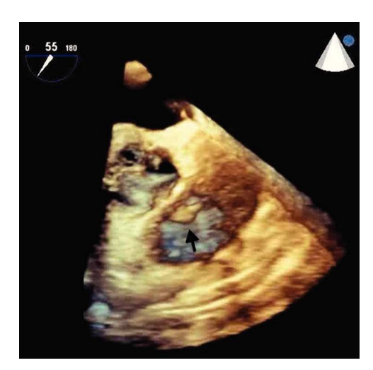
Figure 2 Three-dimensional transesophageal echocardiogram (mid-esophageal view) showing the tumor (arrow) on the pulmonary valve.