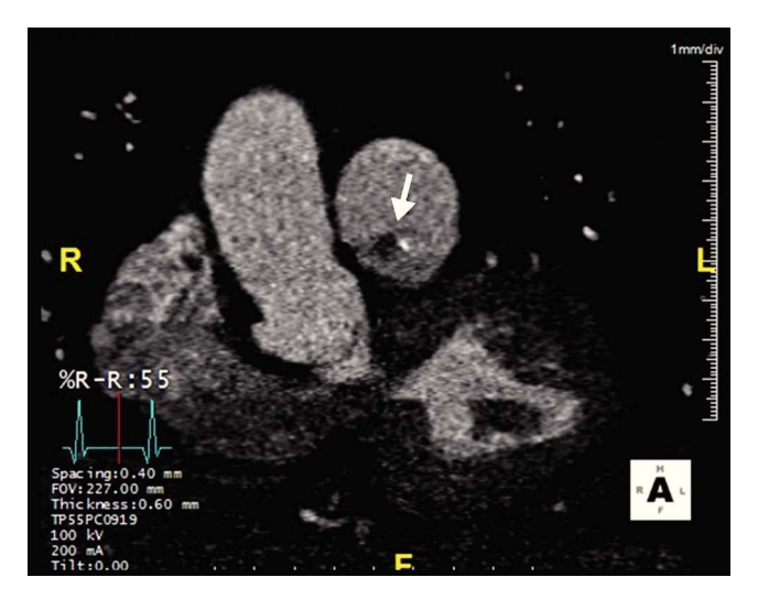
Figure 3 Coronal computed tomography angiography demonstrating a partially calcified mass (arrow) at the level of the pulmonary valve.