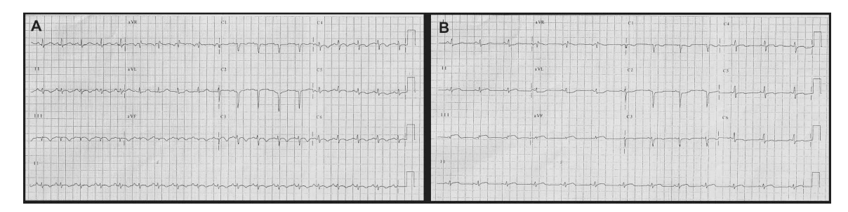
Figure 1 Electrocardiography at presentation with diffuse T-wave inversion (A) and after recurrent chest pain with transient ST-segment elevation in inferior leads (B).

Churg-Strauss syndrome was then diagnosed as four out of six criteria were present in this patient: (1) asthma; (2) eosinophilia; (3) mononeuropathy; (4) extravascular eosinophils.<sup>7</sup> Pulse intravenous (i.v.) corticosteroid