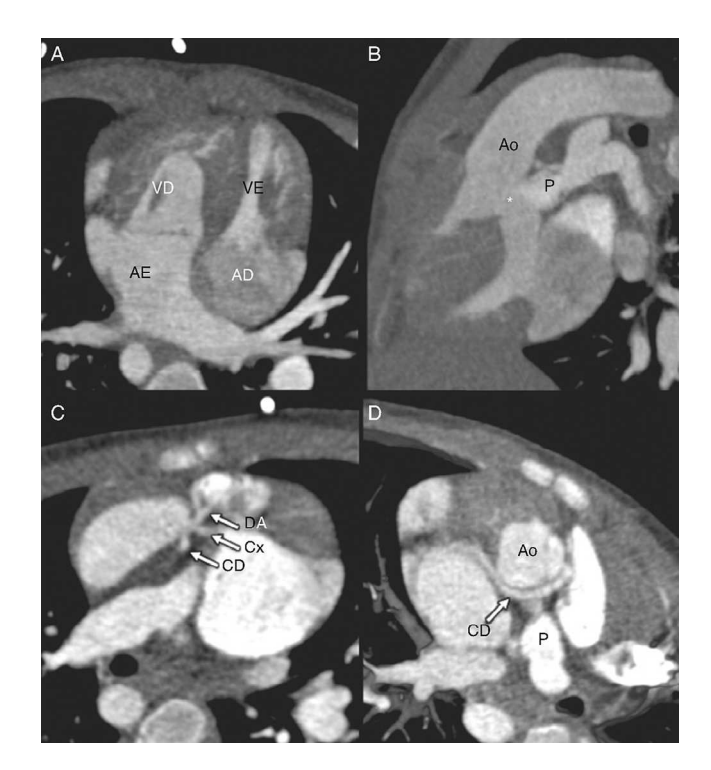
Figure 2 Atrioventricular and ventriculoarterial discordance with a single coronary artery. Axial (A) and multiplanar (B, C and D) reconstructions showing atrioventricular and ventriculoarterial discordance, with anterior right aorta and posterior left pulmonary artery, infundibular septal defect with subarterial communication (asterisk), and anomalous origin of the right coronary artery in the left coronary sinus, coursing between the aorta and the pulmonary artery. AD: right atrium; AE: left atrium; Ao: aorta; CD: right coronary artery; Cx: circumflex artery; DA: anterior descending artery; P: pulmonary artery; VD: right ventricle; VE: left ventricle.

This case illustrates the value of cardiac CT angiography for detailed non-invasive anatomical assessment of intra- and extracardiac structures, and was decisive in the therapeutic decision-making process.