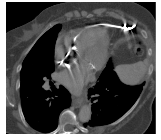
Figure 2 Multidetector computed tomography, with multiplanar reconstruction in oblique axial view, showing the lead course, initially intraventricular and then passing through the right ventricular free wall, with its tip in the paracardiac fat on the left side, close to the chest wall. No pericardial effusion or significant changes in mediastinal fat were observed.