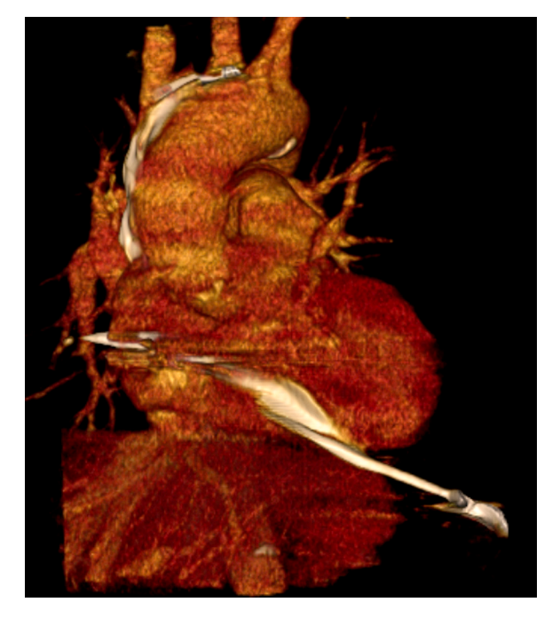
Figure 4 Multidetector computed tomography, threedimensional reconstruction, clearly showing the lead tip outside the heart.