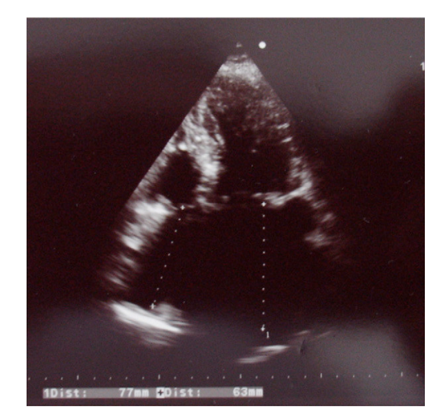
Figure 4 Echocardiogram.

There is usually mild to moderate cognitive deficit, although with considerable interindividual variation. Language is acquired late due to difficulties with articulating various sounds, due in part to palatal abnormalities, while learning difficulties arise from attention deficit and impaired fine motor skills.<sup>3</sup>