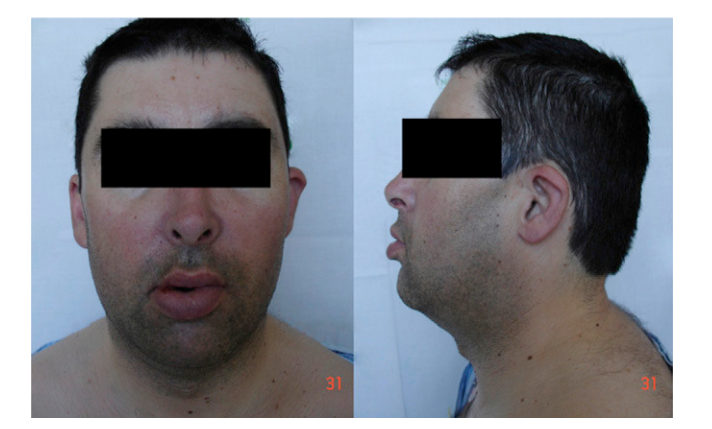
Figure 1 Facial phenotypic abnormalities.

Initial diagnostic assessment revealed partial respiratory insufficiency (Table 1); the electrocardiogram (Figure 2) showed atrial fibrillation with controlled ventricular rate (90 bpm) and nonspecific ventricular repolarization