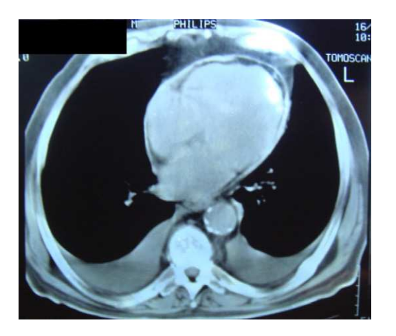
Figure 2 Chest CT showing pericardial thickening and calcification.

During the procedure, the thickened pericardial membrane was completely removed (Figure 4), and pleural and pulmonary biopsy specimens were taken. Anatomopathological study of the specimens showed marked fibrous thickening of the pericardium with focal congestion and nonspecific chronic inflammatory infiltrate, and several focal dystrophic calcifications; areas of pleural fibrous thickening