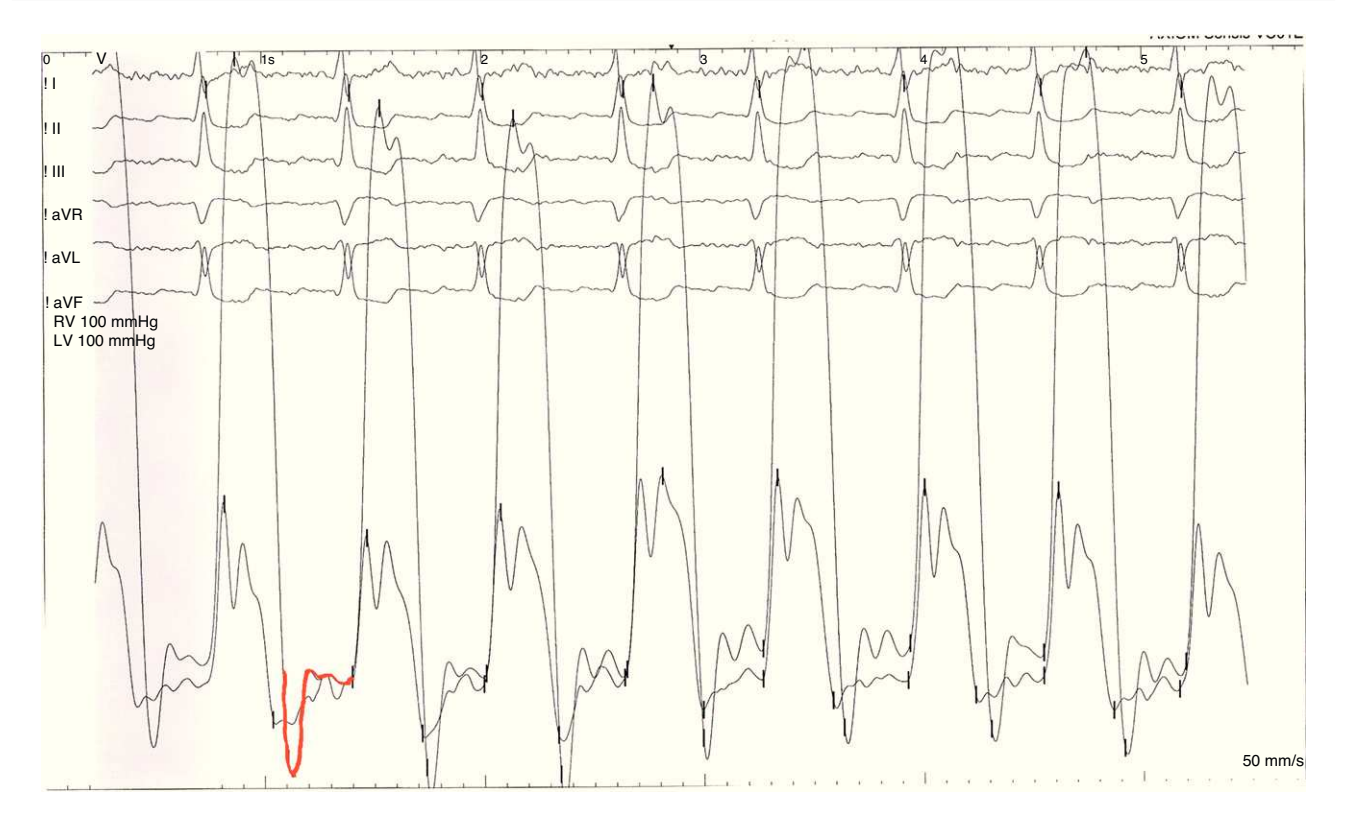
Figure 3 Ventricular pressures with left ventricular dip-and-plateau pattern.

A diagnosis of CP should always be considered in patients presenting with predominantly right heart failure symptoms, such as increased jugular venous pressure, pleural effusion, hepatomegaly, ascites and peripheral edema. Besides these systemic features, another characteristic of CP is the presence of an early third sound (pericardial knock), which results from a sudden cessation of ventricular filling due to pericardial constriction.<sup>2</sup> In more severe cases, there is hypotension and circulatory collapse.