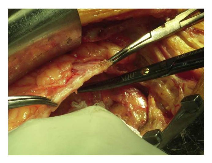
Figure 4 Intraoperative photograph showing thickened pericardial membrane.

Mitral E' of >8 cm/s differentiates CP from RCM with a sensitivity of 89% and specificity of 100%.<sup>4</sup> Conventional, Doppler and 2D strain echocardiography were crucial for differential diagnosis between CP and RCM in our patient, and were also used to assess changes in cardiac