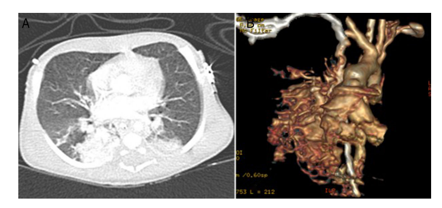
Figure 1 (A and B) Thoracic computed tomography scan showing a pulmonary arteriovenous malformation of the right lower lobe.