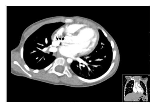
Figure 2 Cardiac computerized tomography scan showing a fistula between the ascending aorta and the right ventricle.