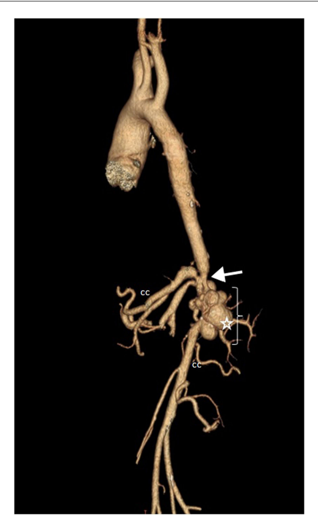
Figure 2 Three-dimensional angiographic sequences demonstrating collateral circulation with engorged vessels (CC), a saccular aneurysm (star) and aortic stenosis (arrow).

Takayasu arteritis, NF-1, Alagille syndrome and Moyamoya disease. Surgery is the primary treatment when it is associated with renovascular hypertension and visceral artery stenosis. Endovascular therapy can be performed in patients with discrete aortic stenosis; however, due to inherent arterial wall anomalies, vascular complications increase