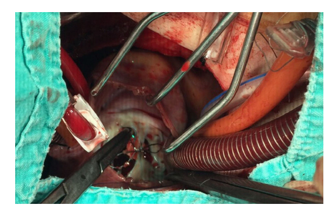
Figure 2 Intraoperative imaging showing that all margins of the occluder device were properly attached to the interatrial septum and there was no displacement.