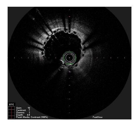
Figure 3 Optical coherence tomography image showing bioresorbable vascular scaffold struts and distal overlapping of metal struts of the stent graft.