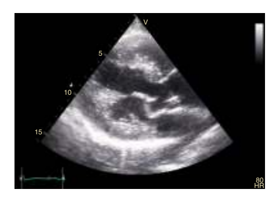
Figure 2 Transthoracic echocardiogram, long-axis parasternal view, showing the mitral valve anterior leaflet aneurysm.

Acquired mitral valve aneurysm is a rare entity which has generally been reported in the context of endocarditis.