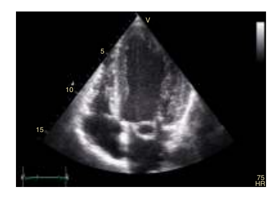
Figure 1 Transthoracic echocardiogram, 4-chamber apical view, showing the aneurysmal sac of the anterior mitral valve leaflet.

A 52-year-old man presented to our emergency department with shortness of breath. He reported exertional dyspnea for the past five years which had worsened recently. He reported no weight loss, fever or poor appetite. His past medical history was noncontributory. The physical exam revealed a diastolic murmur best heard in the aortic area. Echocardiography showed a mildly enlarged left ventricle