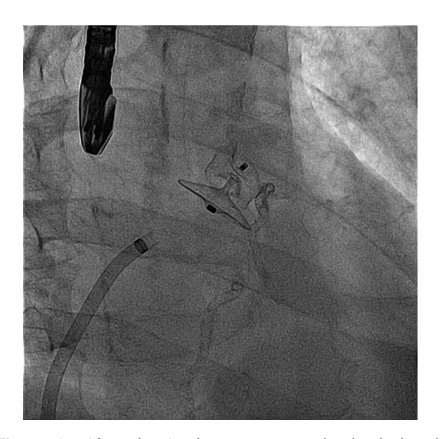
Figure 4 After the Amplatzer was completely deployed, radioscopy confirmed the relationship between the distal lobe of the device and the coronary artery. Although in this patient this latter structure was easily delineated by the previously implanted stents, it is vital to consider this anatomical relationship during the occlusion procedure.

arrhythmias or signs of myocardial ischemia during the procedure.