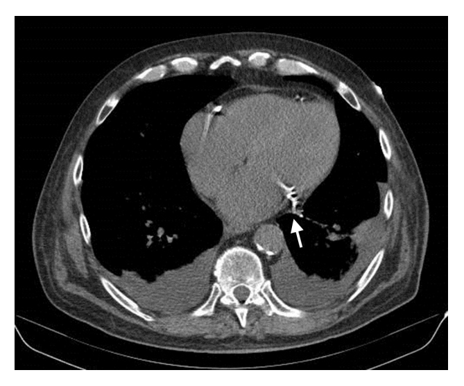
Figure 2 Thoracic computed tomography performed after an episode of alveolar hemorrhage also reveal the proximity of the circumflex artery to the left atrium and left atrial appendage (arrow).