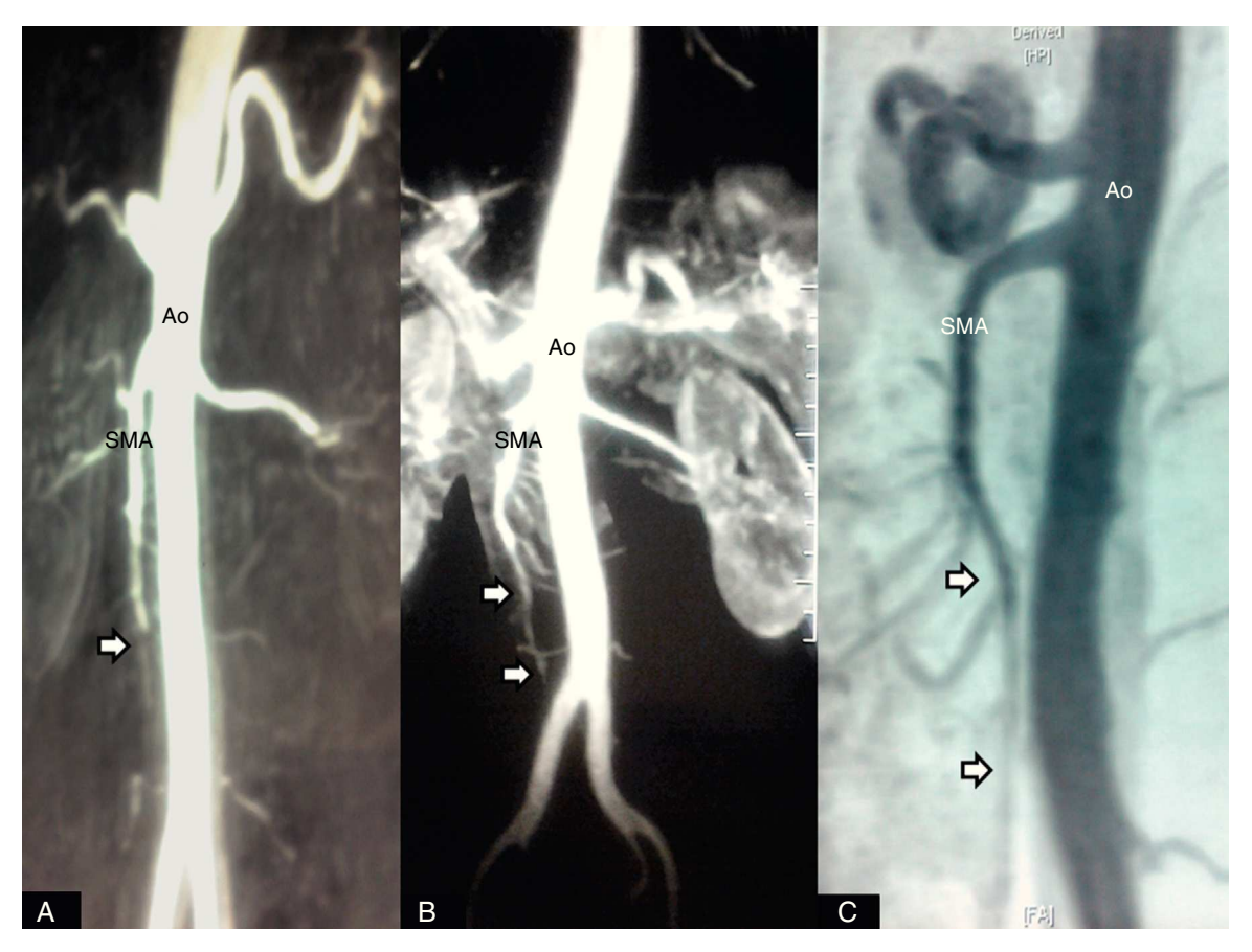
Figure 1 (A) A computed tomography (CT) scan within the first 24 hours showed absence of contrast in the superior mesenteric artery (SMA) (arrow). Follow-up CT scans demonstrated gradual improvement in flow through the SMA (arrows) at 10 days (B) and two months (C). Ao: aorta; SMA: superior mesenteric artery.

The initial approach was to correct fluid and electrolyte imbalance and to start therapy with broad-spectrum